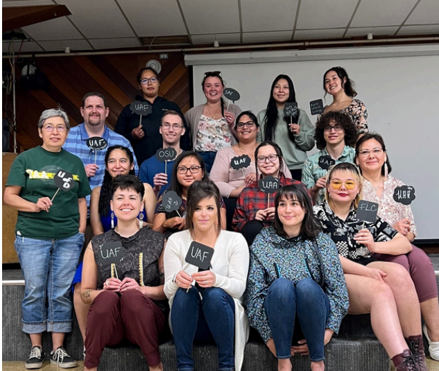
MyCache Scholarship students at MyCache student banquet (2020).

SNC is excited to announce an upgrade to its scholarship program management, as it transitions to a new MyCache Partners scholarship management system, WizeHive. This move reflects SNC's ongoing commitment to streamlining processes and enhancing services for its beneficiaries and descendants.