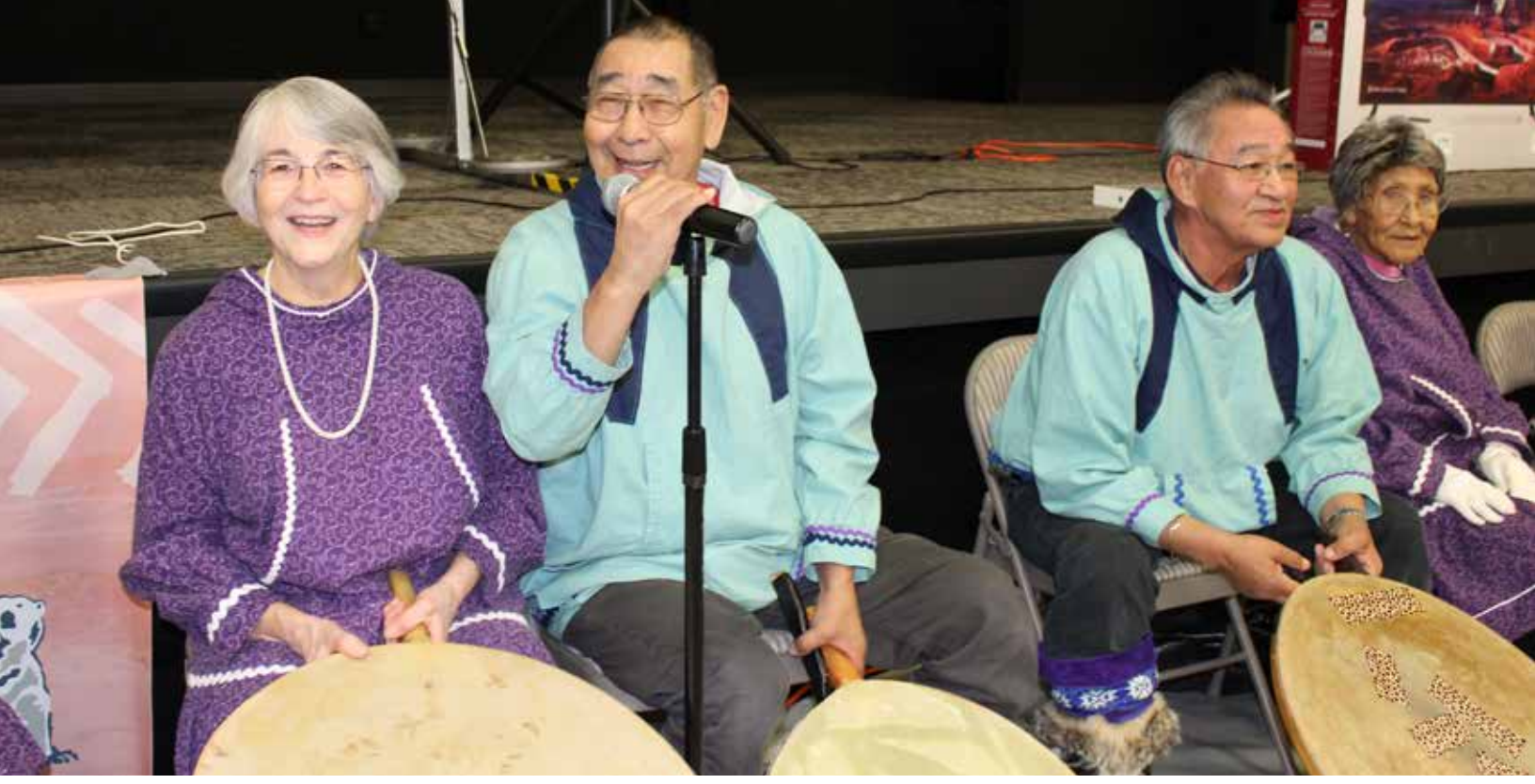
Kingikmiut dancers at the meeting in Anchorage on June 3.