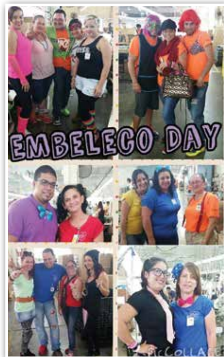
SNCT EMPLOYEES ENJOY EMBELEGO DAY "CRAZY DRESS DAY."