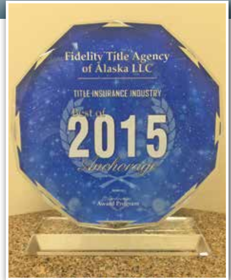
DURING 2015, FIDELITY TITLE AGENCY OF ALASKA, LLC EXCEEDED ITS PROJECTED GOALS. AT THE END OF THE YEAR, THE ANCHORAGE AWARD PROGRAM PRESENTED FIDELITY TITLE AGENCY OF ALASKA WITH THE "TITLE INSURANCE INDUSTRY, BEST OF 2015 ANCHORAGE" AWARD.

Since the acquisition of the two title companies, Sitnasuak Financial Services has posted business unit income in excess of $2.2 million and $2.4 million in the years 2013 and 2014 respectively. Financial Services just ended a phenomenally good year in 2015 and expect final business unit income to exceed a record high of $2.8 million.