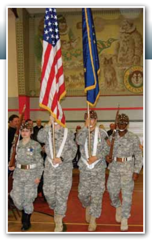
CADETS FROM THE NOME-BELTZ JROTC PRESENT THE COLOR GUARD AT THE FRIENDS OF THE NRA BANQUET, OCT. 4 IN NOME.

JROTC teaches citizenship and leadership skills in a disciplined and structured environment to high school students. For cadets who stick with it and work hard, JROTC offers mentoring, college credits and advanced rank and pay if they pursue a military career.